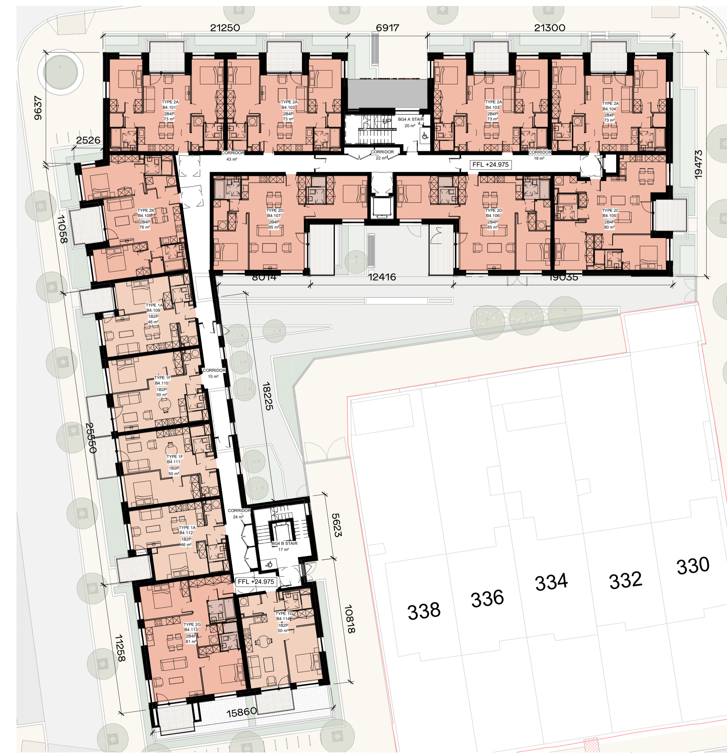
2 1200 BG4 BLOCKPLAN L01 FFL 1: 200