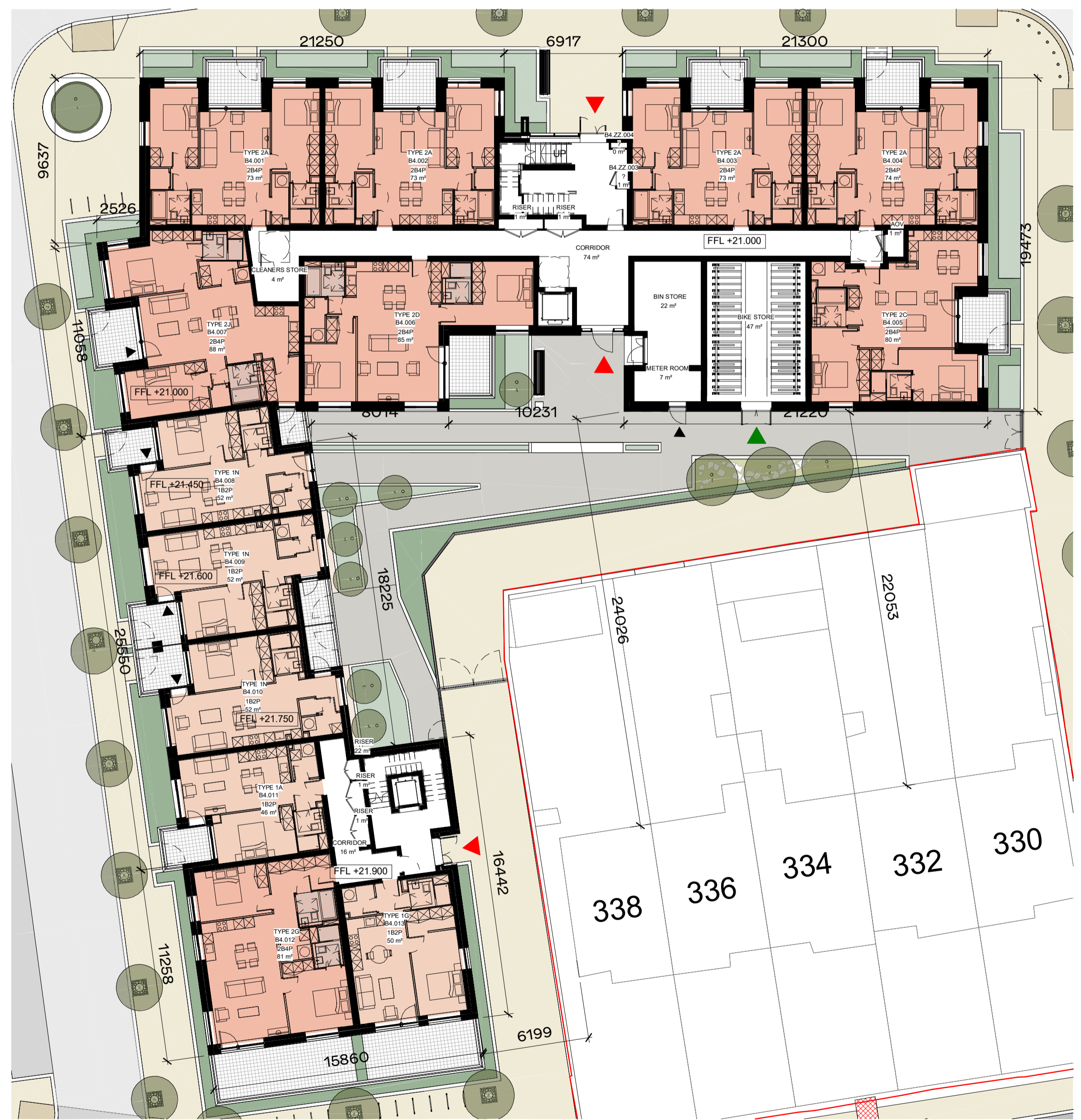
1 1200 BG4 BLOCKPLAN L00 FFL 1: 200